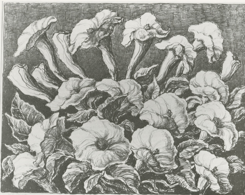
Fig. 18 Birger Sandzen, White Trumpets , 1935, lithograph (Birger Sandzen Memorial Gallery, Lindsborg)