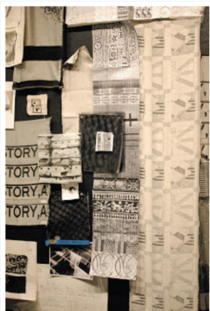
Display showing the work process of Schira