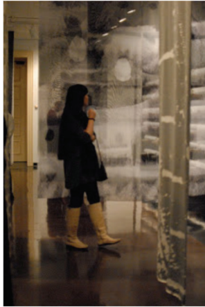
A viewer stands in front of large textiles in the new show An Errant Line

The Spencer Museum of Art has launched An Errant Line , an impressive large scale textile installation by Ann Hamilton and Cynthia Schira. The show spans many galleries of the museum, and took eight years to plan. An Errant Line refers to threads of a textile that float freely on a loom making an unexpected decorative pattern. A happy mistake or opportunity, these lines are a result of threads pulled from a tight weft. These irregular lines are called "errant."