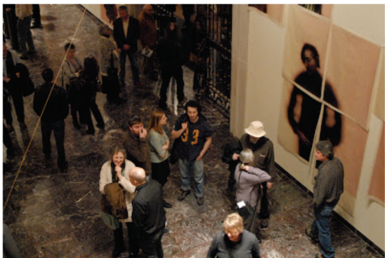
Installation as seen from above