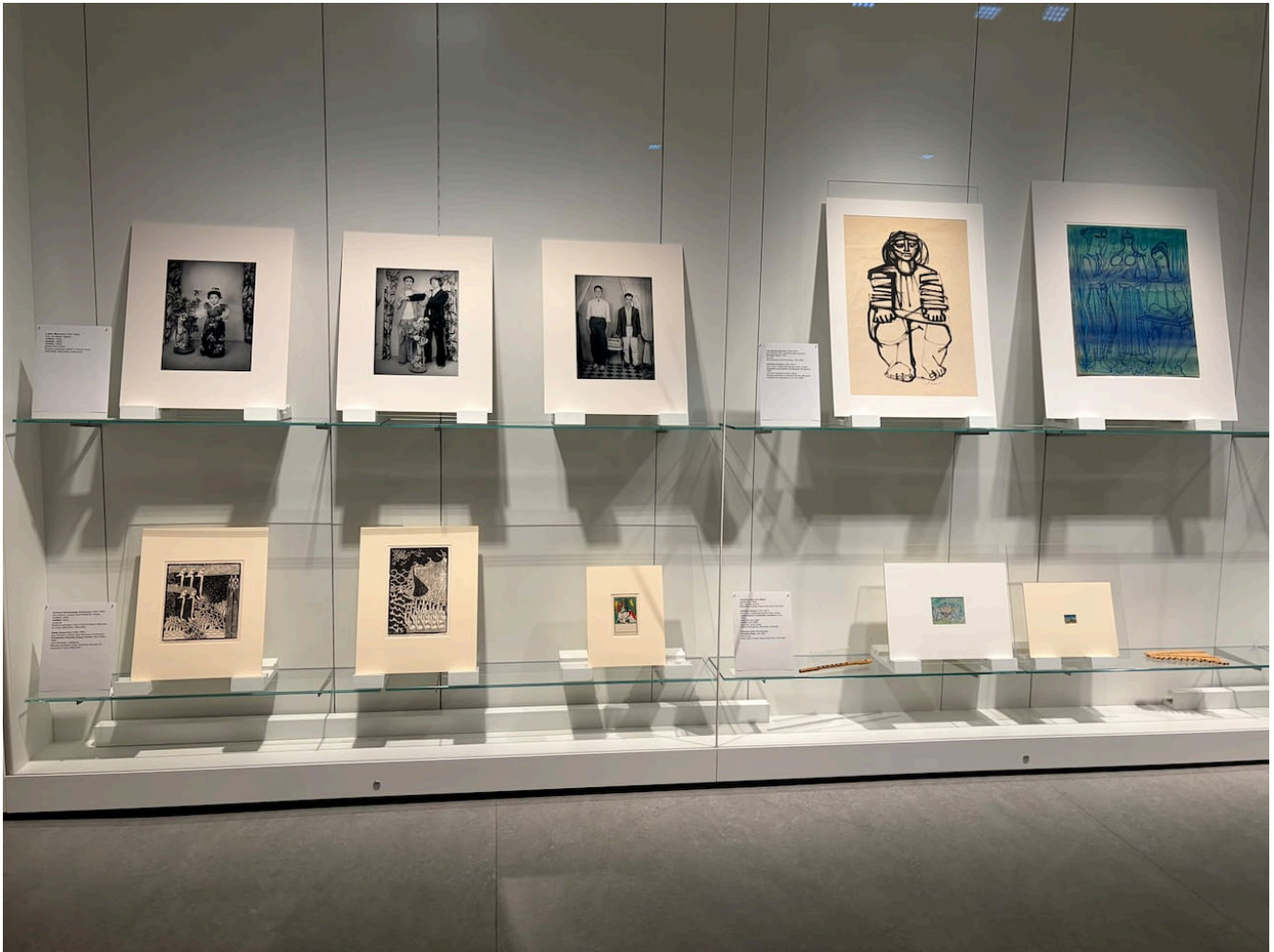
The Spencer Museum of Art opened "Welcoming the World to Lawrence" on Tuesday, showcasing artwork from eight countries competing in the 2026 FIFA World Cup.