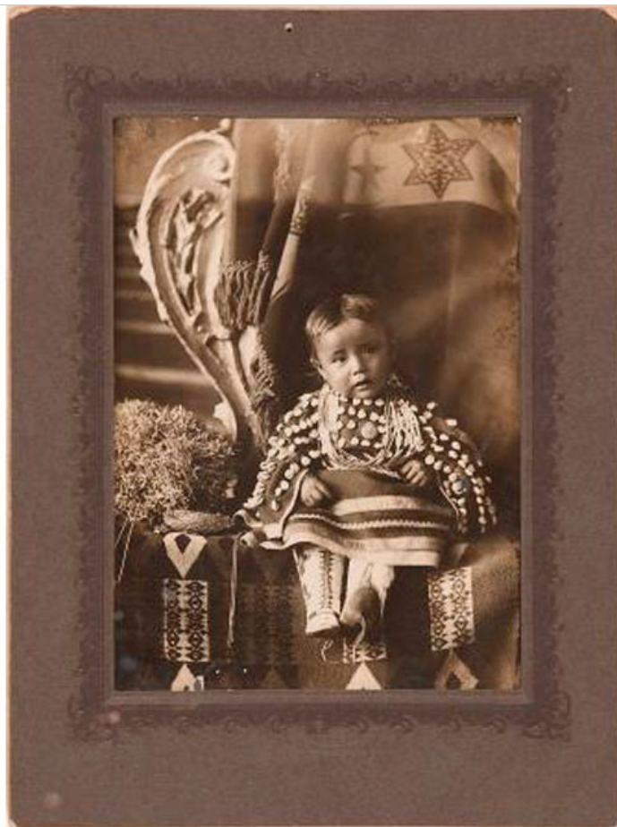
Fred F. Shiffert, Portrait of a very young girl.