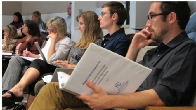
RA-101 provides a valuable introduction to key topics (2012 above).

The two-hour sessions address a wide range of issues, including submitting grant proposals, award spending and monitoring, intellectual property issues, and the responsible conduct of research. The course is also an opportunity to develop contacts across campus.